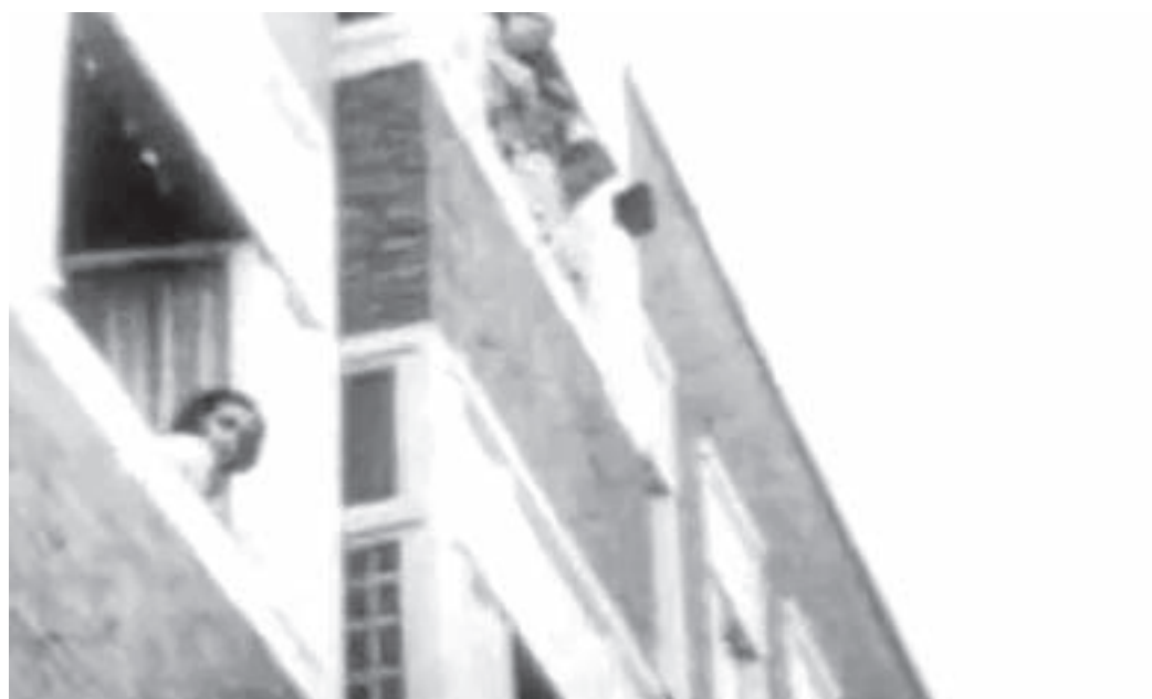
Anne Frank leans out of the window of her house in Amsterdam to get a good look at a bride and groom on July 22, 1941. It is the only time she was ever captured on film.